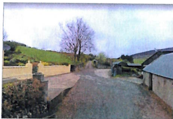
Figure 9 - Agricultural Access track which leads to the wind farm

It is proposed the UGC would then pass through a private agricultural access track which leads to the windfarm. The UGC would pass through Folios WD9242, WD5865 & an unregistered folio for approx. 2,270m