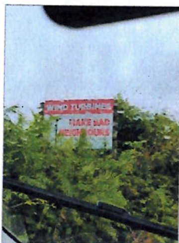
Figure 8 - Local Objectors to Wind Farms

After crossing Bridge C5, the UGC route diverges north to follow an unnamed local road for approx. 3,212m. This section of the route has numerous OHL crossings, 2 No. drain crossings C6 & C7 and must share the road with Irish Water infrastructure. This road has numerous residential and agricultural properties that would appear to be opposed to wind farms in the area, see Figure 8 below. Similar posters could be seen at entrances to several properties along this section of the route. As there is a visual presence of objectors to wind farms in the area, this could also pose a risk to a cable route in this area.